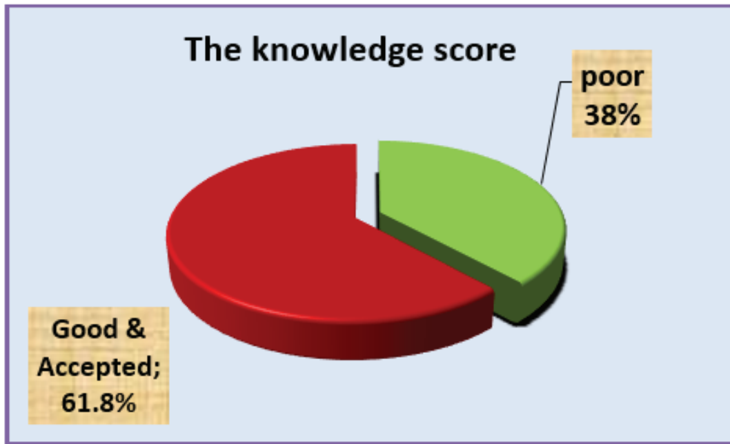
Figure (1): The knowledge score of EBF.

According to the relationship of knowledge among lactating mothers and the demographic characteristic, not significant with the age of mother (P.value > 0.05), while the association was found to be statistically significant for each of (Type of delivery, Residence, Education level of mother and Mothers occupation) (P.value < 0.05) as shown in table (3).