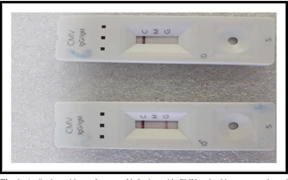
Fig. 1: Antibody rapid test: In case of infection with CMV or healthy persons, the red color will appear on the letter G, non-infection with CMV, color appears only on the letter C.

This study revealed that patients age in more than fifty years (38%) were at high risk of developed renal failure disease compare with other study groups. Our findings were in agreement with the results of other studies( Sepehrv et al. , 2010: Zhang and Rothenbacher,2008; Hsu et al. 2008). They showed that the incidence of renal failure disease increases with age.