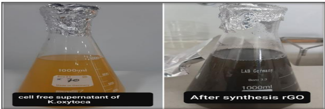
Figure 1: Biosynthesis of rGO Nanoparticles in BHIB from K. oxytoca , the color shift from yellow to black indicate biosynthesis of rGO at optimum conditions (37°C for 24h in shaking incubator with 150rpm).

The utilization of biological systems for manufacturing is still in its early stages, and scientists have been using on microorganisms as prospective eco-friendly nano factories [24]