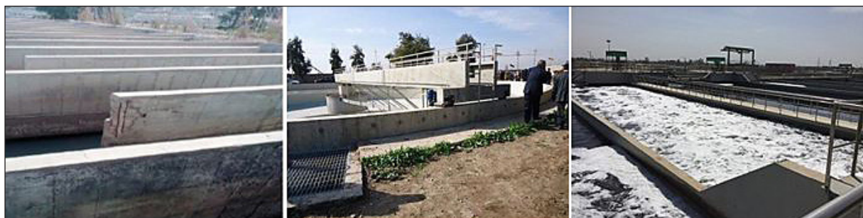
Figure 1. Illustrative photos of Al-Muamirah treatment plant, Hilla city, Babylon governorate