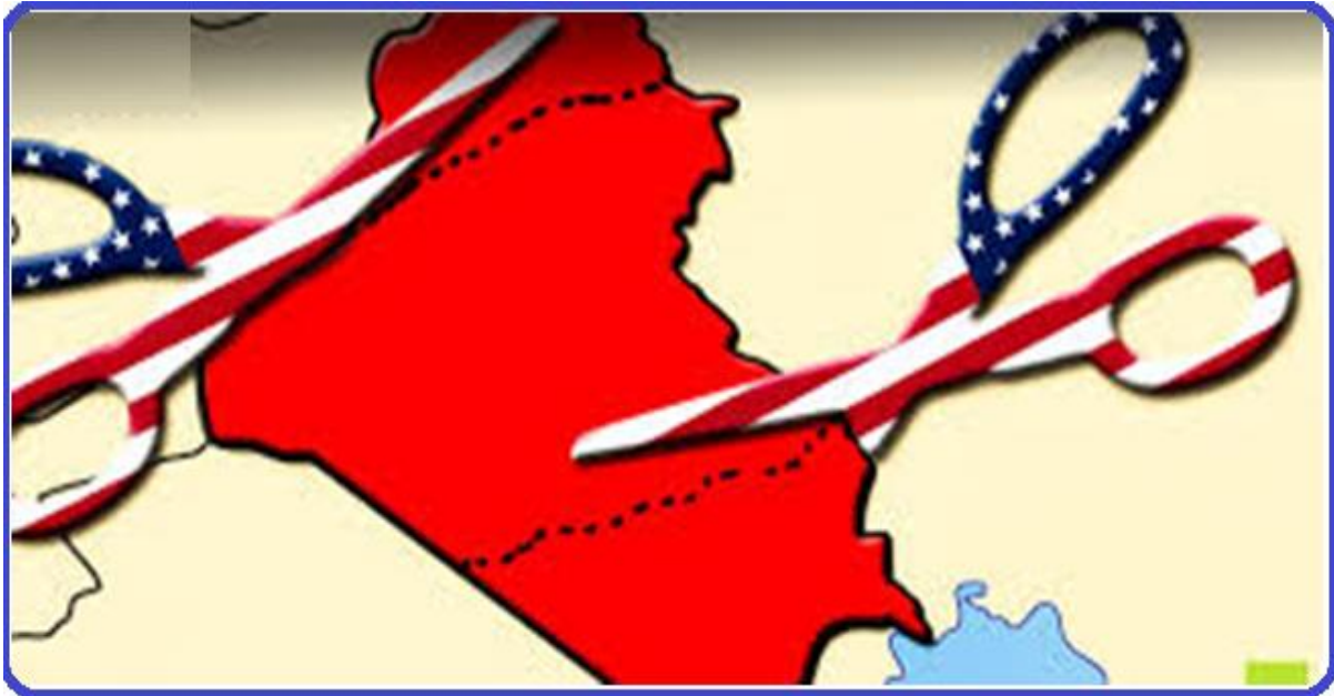
Fig (4): Sectional division in Iraq as a result of Aggression

The U.S.-controlled attack of the realm in year 2003, takes the origin reason of partisan passion in stake Aggression Arab Iraq. Stake -2003 legislations have been conquered thru the rivalry concerning sect-centric Shia with Sunni strengths (96-100) .