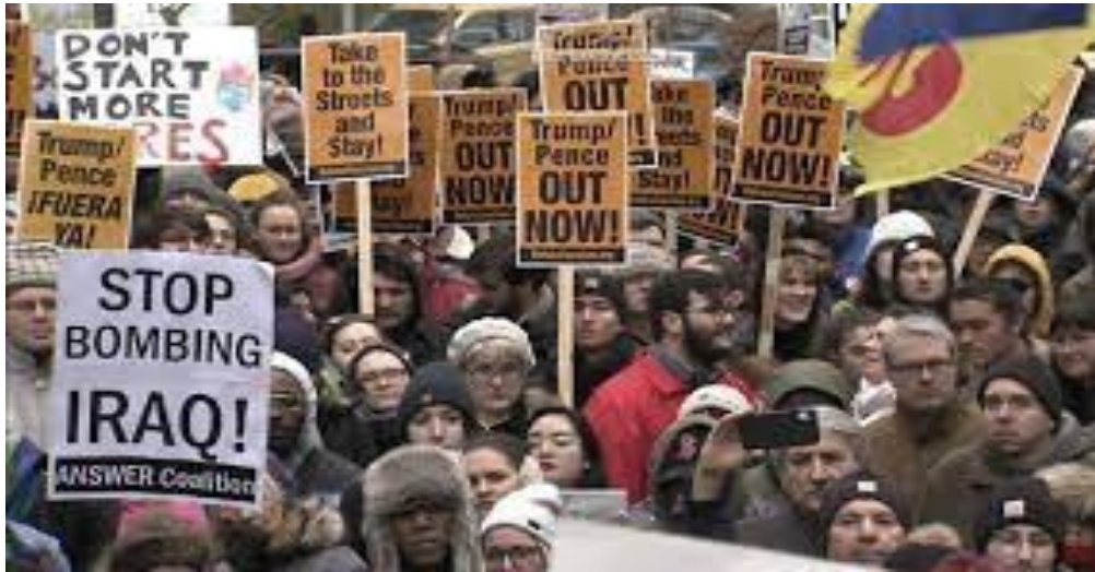
Fig(2): Anti Aggression protest in (U.S) in Year 2002

Still the Iraqi command distorted speedily (Baghdad chop inside 3 weeks of the preliminary attack), the Aggression itself has hauled on uniform subsequently the culmination of endorsed exploit in 2011. An American worker was slayed with numerous American militaries were hurt thru a rocket attack in northern Iraq in Dec. year 2020 -17 years next Doran avowed that the Aggression would reform the district for the improved (70-88) .