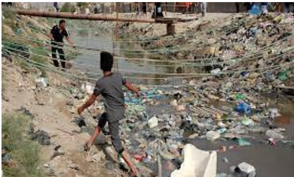
Fig (6): Environment and Lack of Services as a result of Aggression

Accessibility of water to cultivation, commerce and domestic provisions is a main issue to Iraq. The superiority besides to measure of the realm's water is jammed thru upstream stemming, effluence, macroclimate alteration with inept custom. Iraq's milieu has smarted critically from the bearing of unfortunate plans on effluence and store controlling. As a outcome, the realm is unprotected to a variety of conservational issues, counting scarcity, desertification and growing soil (126-129) salinity.