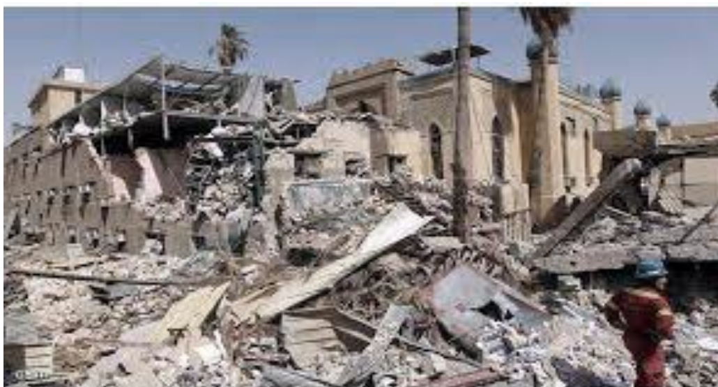
Fig (3): Demolition of Infrastructure as a result of Aggression

We were oblivious, haughty, besides to spontaneous, with we unbridled hominid distress that did no respectable to any person: not aimed at Americans, not aimed at Iraqis, not aimed at the district. Virtually many years later, the harm to America's upright in the ecosphere since the Iraq Aggression has motionless no mended (89-95) .