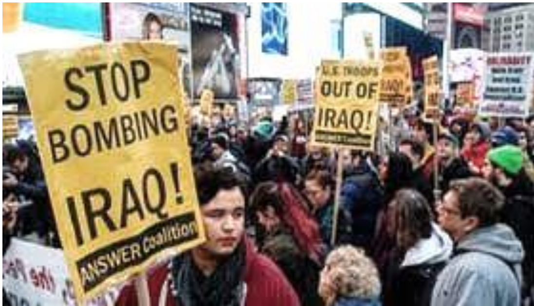
Fig(1): Anti Aggression protest in London in Year 2002

aggression. The attack of Iraq stood strappingly contrasting thru specific elongated-upright U.S. supporters, comprising the régimes of Germany ,France, New Zealand besides to Canada. Their frontrunners claimed which near stayed not any indication of guns of frame annihilation in Iraq with that occupying that realm remained no right (31-40) in the milieu of UNMOVIC's(12- February 2003) bang. Approximately 5,000 chemical Aggression heads, missiles or flight missiles were exposed thru the Iraq Aggression, while these taken erected with uncontrolled former in Sadaam Hosain's statute already the 1991 Gulf Aggression. The sightings of these chemical guns did no provision the regime's attack logic (41-52) .